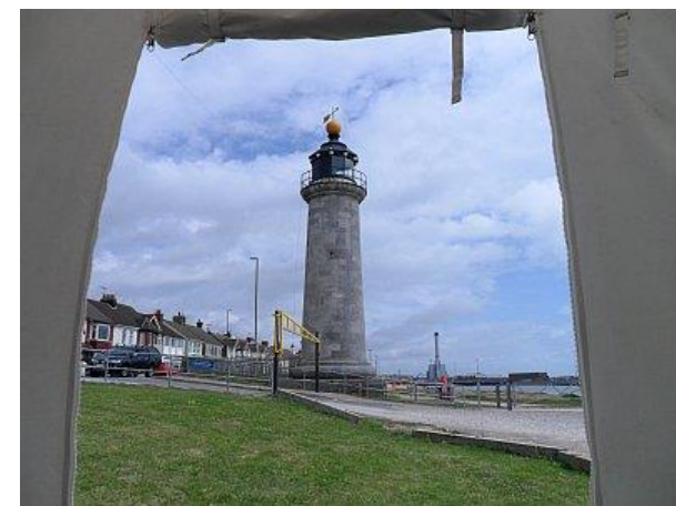
Shoreham Lighthouse, Southern England.

For some reason or other August seems to have become the international weekend for lighthouses. Countries all over the world have become involved in one for or another of lighthouse activity. Some years ago the United States Congress declared August 7th as their National Lighthouse Day and during that first week in August amateur radio operators in America set up portable stations at lighthouses and endeavour to make contact with each other. Unlike the ILLW there are prizes and certificates awarded for this event.